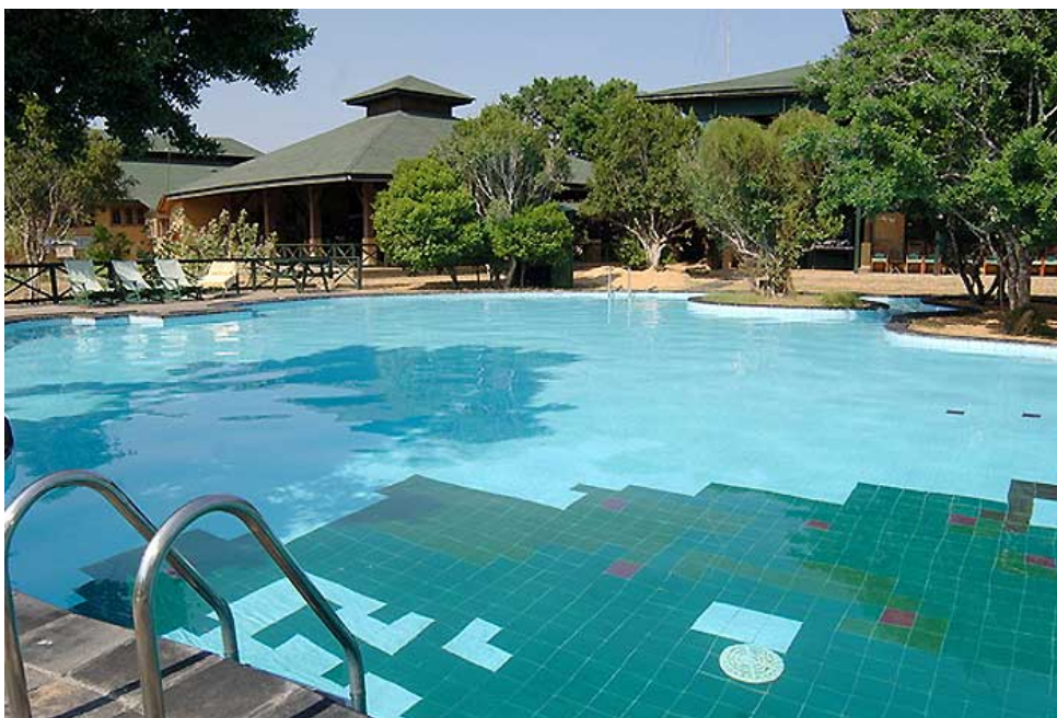
Pool At Yala Village

Perfect for honeymooners. This tower chalet offers panoramic vistas of the surrounding forest, sea and rocky outcrops where leopards are frequently spotted. Perfect dining on the private verandah, with chaises lounges and your personal chef/butler.