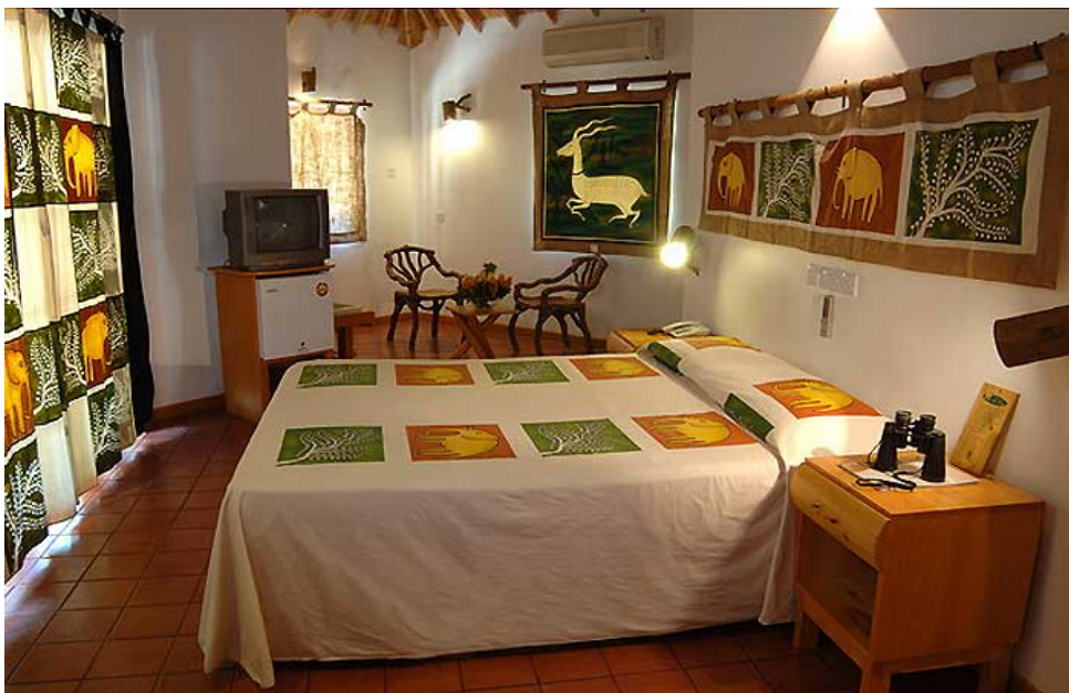
Jungle Cabana At Yala Village

Luxury living in harmony with wildlife is the concept behind Yala Village , a deluxe resort hotel in the buffer zone of Yala National Park . The hotel blends subtly into scrub forest in a scenic location, stretching from a lagoon to the border of Kirinda beach, which boasts some of Sri Lanka's finest unspoilt sand dunes. Animals may wander through the village unhindered as the management pursues a policy of co-existing with nature.