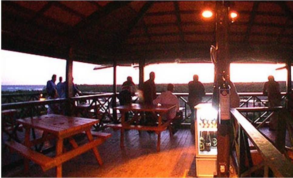
Yala Village Wildlife Observation Deck