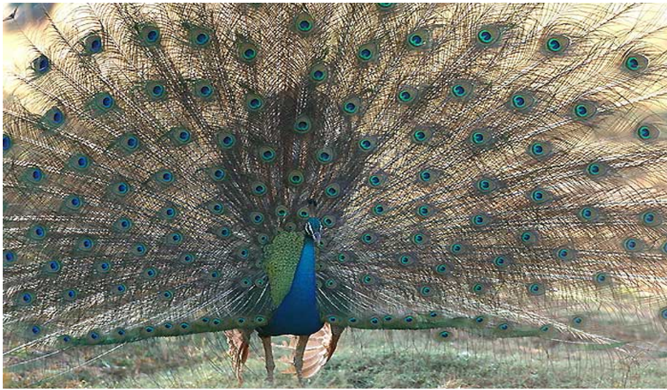
Peacock At Yala