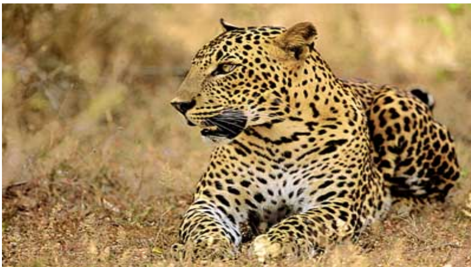
Leopard At Yala National Park

Those interested in culture and religion will be interested in the pilgrimage town of Kataragama which is sacred to Buddhists , Hindus and Muslim pilgrims who come to pray at separate shrines in close vicinity to each other. Blue Whales are often seen close to the shore from the vantage point the Kirinda Temple , an ancient and exquisitely located Buddhist stupa overlooking the sea.