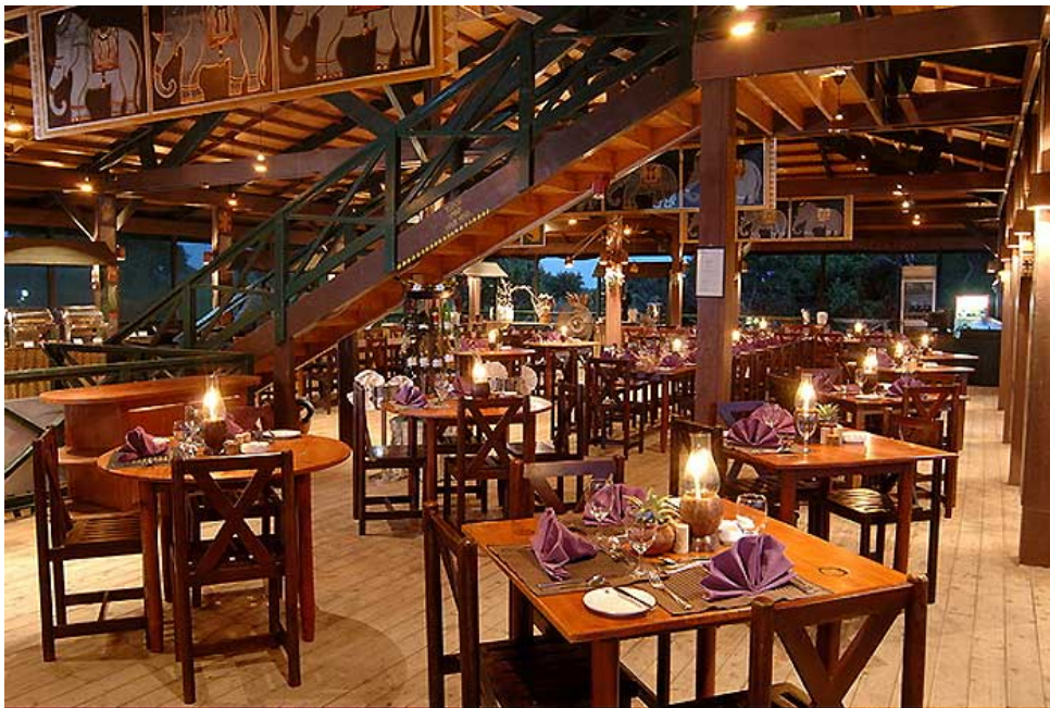
Restaurant At Yala Village