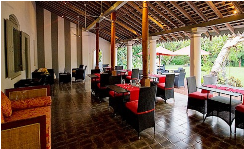
Restaurant At The Wallawwa