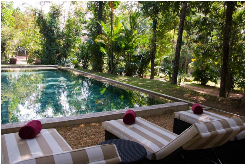
Pool In Tropical Gardens

Explore the Muthurajawella wetlands situated just 10 minutes from The Wallawwa . These wetlands cover an area of about 6,000 hectares inclusive of the Negombo lagoon. The daily high tide brings in seawater from the ocean into the wetland. Continuous mixing of these two waters over thousands of years, has led to a brackish, integrated coastal ecosystem that is biologically diverse and teeming with life. Numerous species of birds, butterflies and fish, some of which are endemic, are found in this habitat. Crocodiles, monitor lizards, and python, are found here.