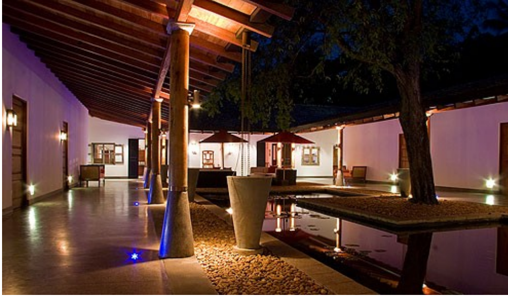
The Wallawwa Courtyard At Night