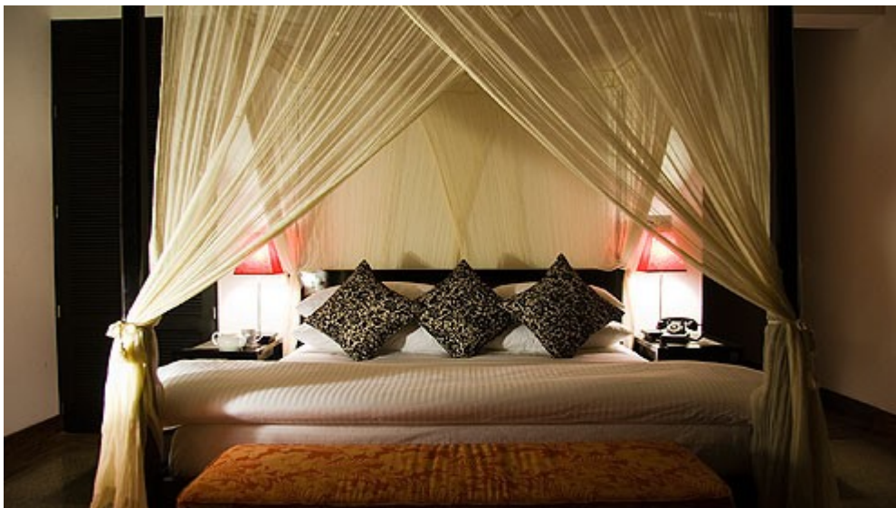
Bedroom At The Wallawwa

The Wallawwa has 14 bedrooms – 10 Garden Suites and four Wallawwa Bedrooms . All bedrooms boast Balinese four-poster beds, wifi internet access, widescreen satellite TV, and terrazzo-lined en-suite bathrooms with rainshowers. Garden Suites are more spacious and benefit from their own private verandah whilst the Wallawwa Bedrooms are ideal for guests looking for a pre or post flight stopover. Interconnecting rooms are also available upon request.