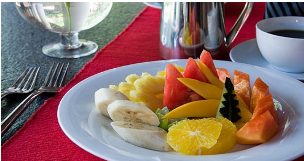
Fine Dining At The Wallawwa