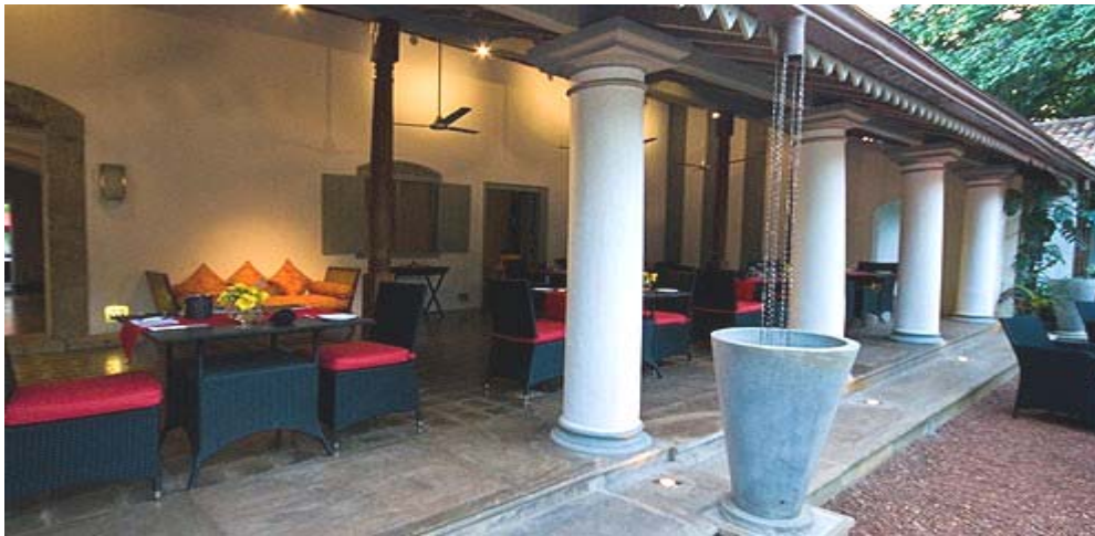
Beautiful Colonial Architecture

The swimming pool is set amidst the landscaped gardens. The Z Spa with four treatment rooms offers an array of relaxing massages and therapies. There is a Library full of interesting titles on Sri Lankan and International philosophy, politics, culture and heritage. The Wallawwa provides a personalised service with a team of butlers to cater for your every whim.