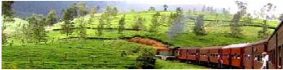
Hill Country Express