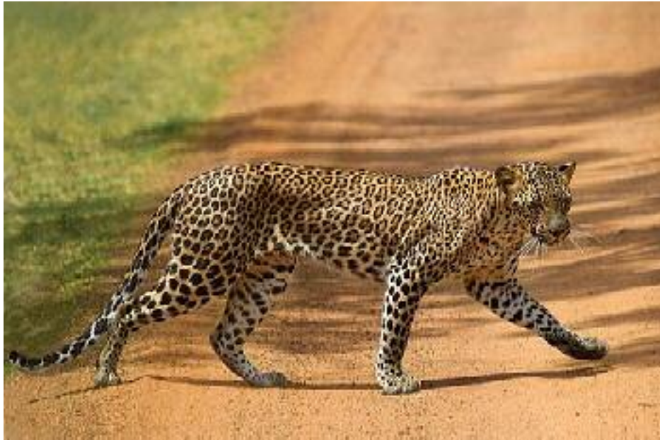
Leopard Crossing Road At Yala