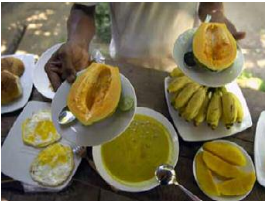
Authentic Sri Lankan Cuisine At The Mudhouse

An idyllic location to sample rural Sri Lanka at its best. The village of Anamaduwa lies in the interior of the island, surrounded by paddy fields and coconut estates but away from the well-trodden tourist routes. The Mudhouse is a very unique and comfortable property built out of natural materials located in a large 50 acre area of forest and jungle.