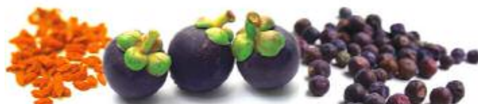
Sri Lankan Fruits And Spices