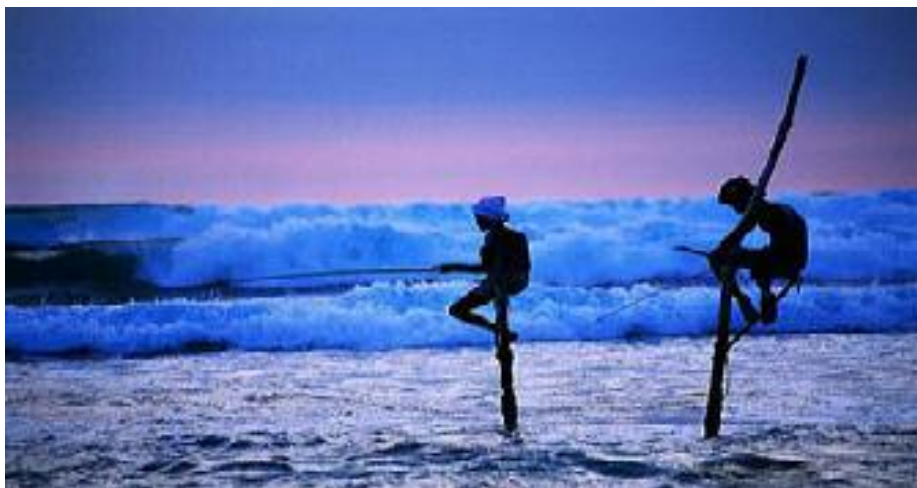
Stilt Fishermen At Weligama

Beautiful and undeveloped beaches in the Deep South of the island near to the idyllic Weligama Bay . Great for those seeking relaxation in tranquil surroundings. A few kilometers from Koggala the unique stilt fishermen of the island can be seen perched on sticks planted in the sea.