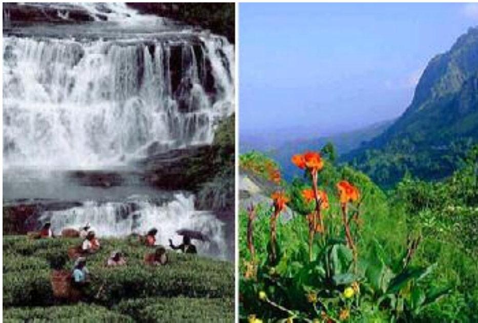
St Clair's Falls And The Ella Gap

Without doubt One Of The Most Beautiful Train Journeys In The World . The observation car gives magnificent views of the Hill Country while passing cascading waterfalls.