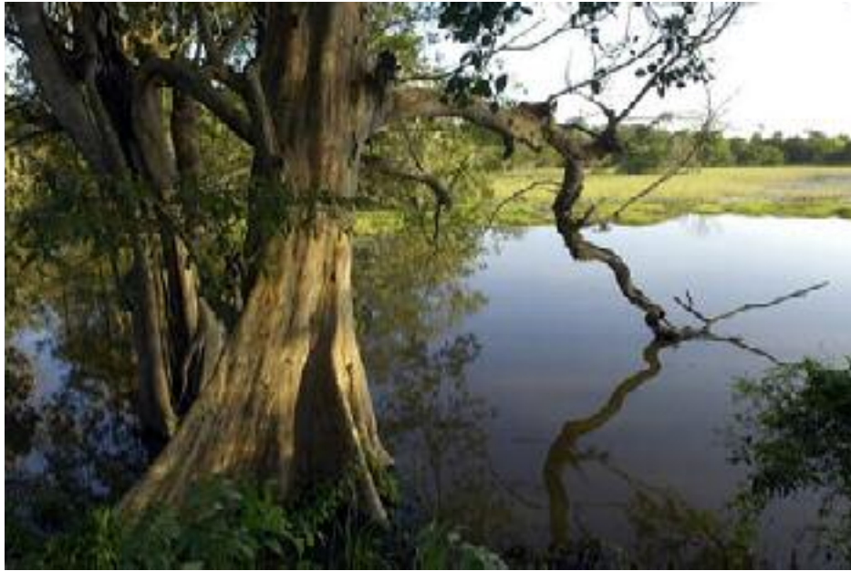
Idyllic Lake Near The Mudhouse