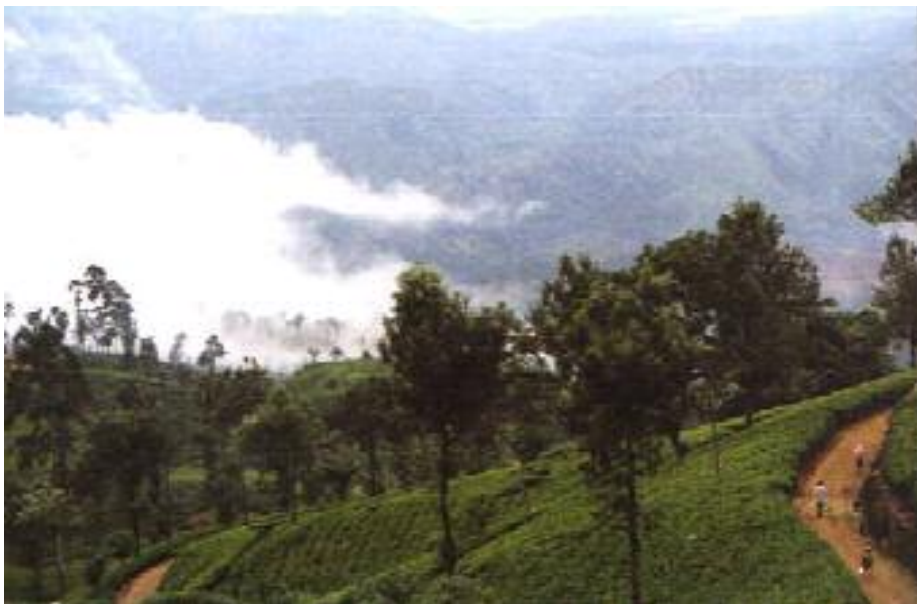
Dramatic Hill Country Views At Haputale

A town that has perhaps the most spectacular location in Sri Lanka , straddling a ridge with a dramatic view down to the coast on one side and the basins of the Uva Hills on the other.