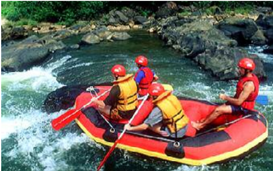
Navigating Rapids On The Kelani River

Try some exhilarating White Water Rafting in the gushing Kelani River at Kithulgala . This stretch of water is ideal for 'beginners' with 5 heart-stopping rapids in quick succession. No previous experience necessary.