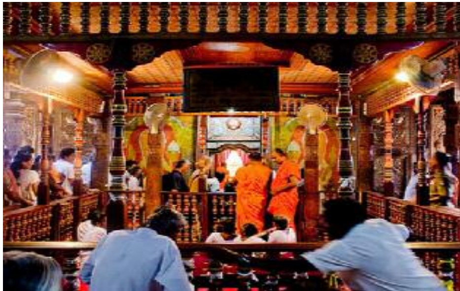
Inside The Temple Of The Buddha's Tooth

An extremely ancient series of 5 cave temples containing thousands of Buddhist images and paintings, which date back 2000 years. Sri Lanka's artistic masterpiece and a UNESCO World Heritage Site of prime importance.