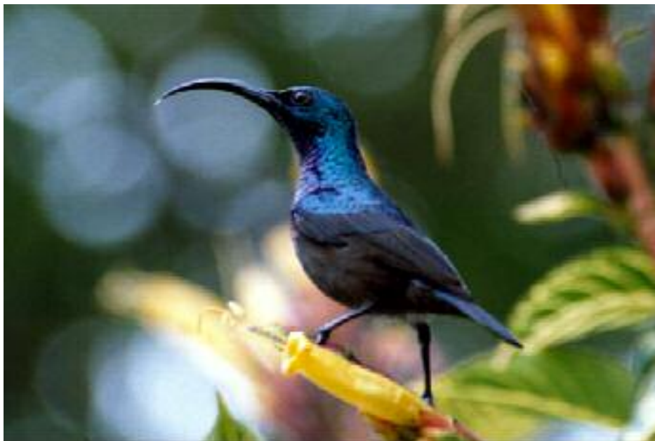
Long Billed Sunbird

Kithulgala contains an area of lush tropical vegetation which is famous as the site for the filming of Sir David Lean's classic ' The Bridge Over The River Kwai '.