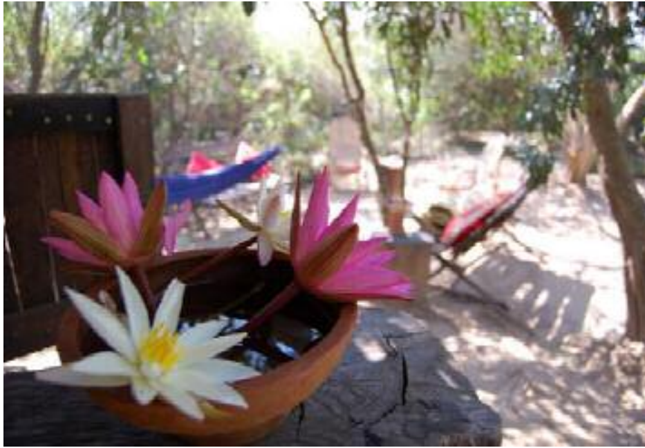
Beautiful Surroundings Of The Mudhouse