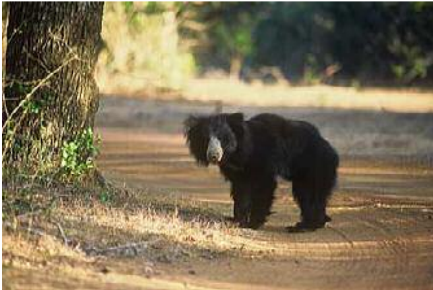
Sloth Bear At Yala

Yala is now gaining an international reputation as the best place to watch Leopards in Asia . It has the highest population density of Leopards in the world and is one of the few locations where they can be observed during daylight hours.