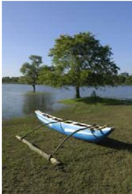
Lake Picnic At The Mudhouse