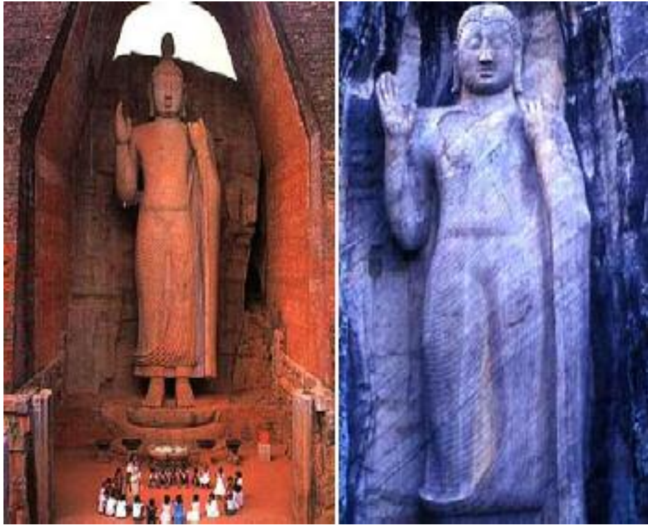
Colossal Buddha's Of Aukana And Sasseruwa