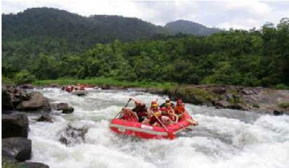
White Water Rafting At Kithulgala