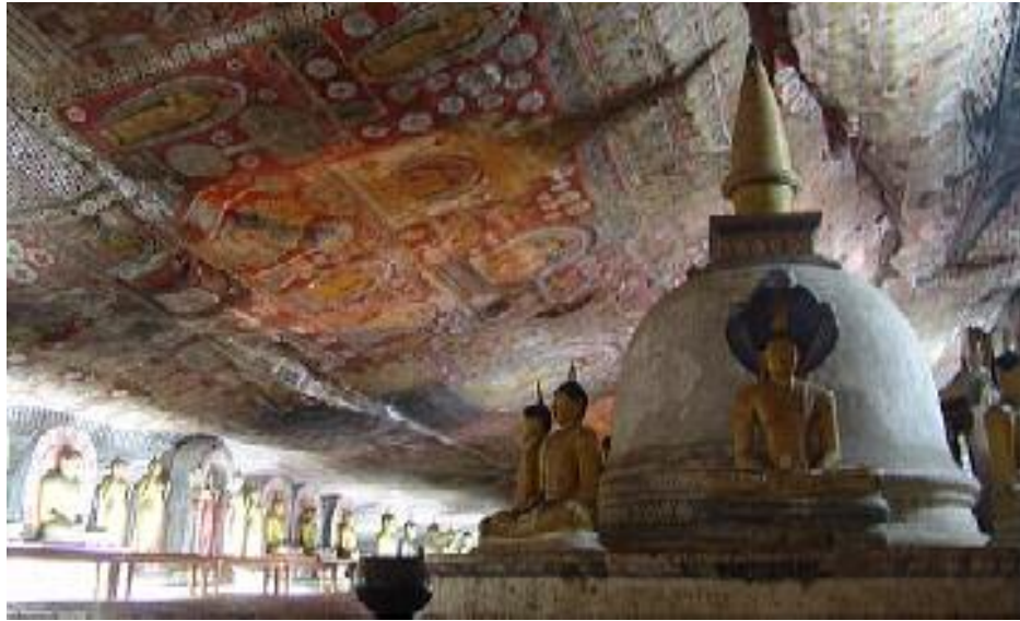
The Golden Cave Temple At Dambulla