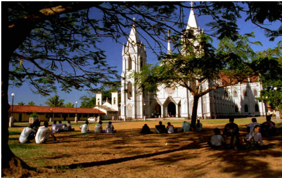
Old Church In Negombo Town

The long and wide Negombo beach is located to the north of the town. Negombo Lagoon is a very shallow and highly picturesque expanse of water to the south of town. Boats can be easily hired from the jetty at the lagoon entrance and sunsets over the lagoon are very much recommended.