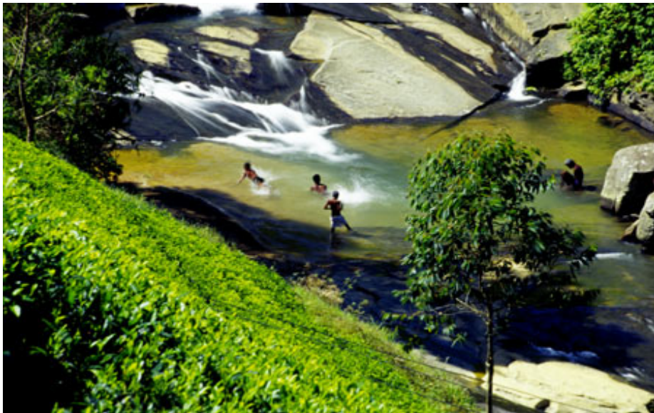
Idyllic Tea Estates And Waterfalls At Ella

Perhaps the most magnificent view in Sri Lanka is seen from the garden of the Ella Rest House . Isolated hills on the plain can be seen 'popping up like islands in the mist'.