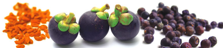
Sri Lankan Fruits And Spices