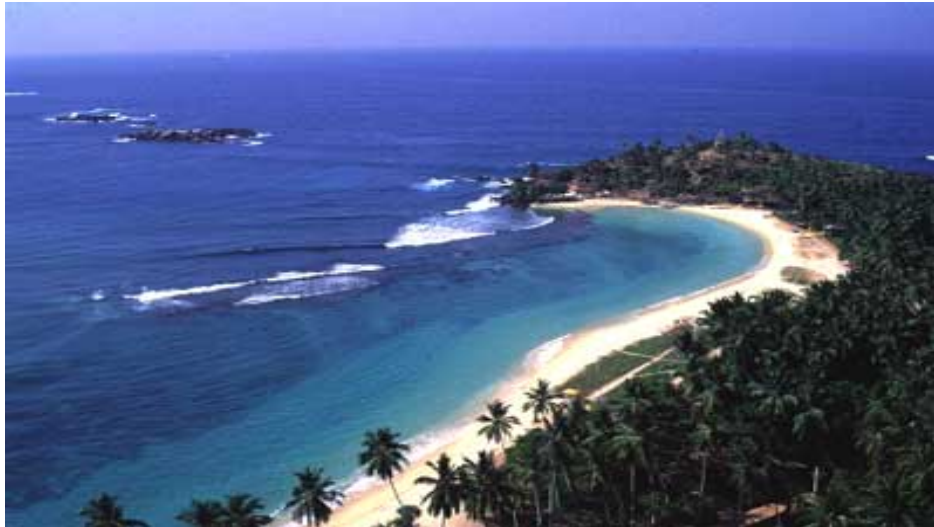
Reef Protected Unawatuna Beach