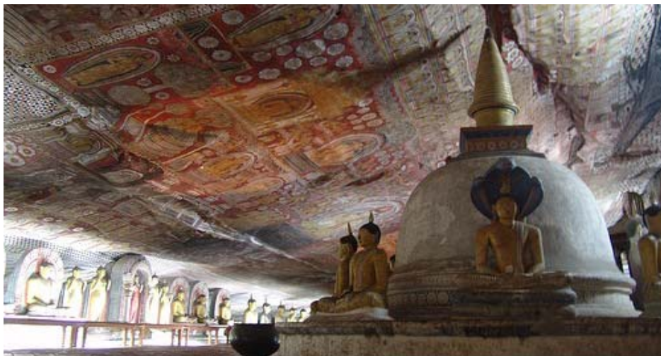
The Golden Cave Temple At Dambulla

Set in a pretty riverside location, this is home to about 70 Elephants - the largest group of orphaned Elephants in the world! Most have been found injured or abandoned in the wild. Baby calves, some only a few weeks old are fed by bottle and the whole herd is then bathed in the adjoining river. A tour highlight for many visitors to Sri Lanka .