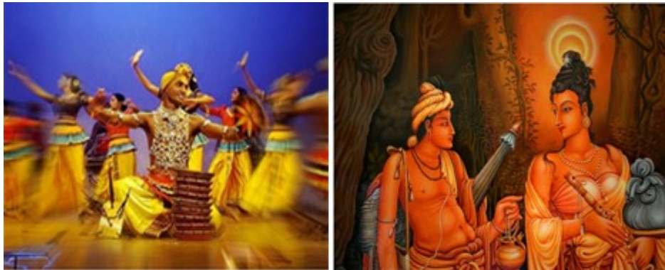
Kandy Temple Dancers And Paintings At Temple Of The Tooth

The remarkable 'fortress in the sky'. A magnificent rock citadel with beautiful frescoes hidden in a natural cave dating from 470 A.D. The climb to the top from the huge stone Lions Paws is a dizzying experience with superb views over surrounding forests and distant hills. The newly excavated Royal Pleasure Gardens at the foot of the rock are some of the earliest from antiquity. Thought by many to be the 8 th Wonder Of The Ancient World!