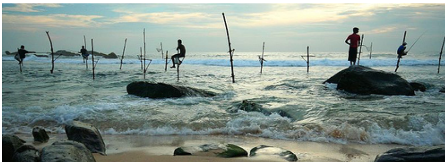
Stilt Fishermen At Koggala