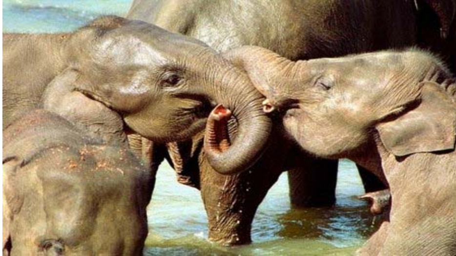
Pinnawela Elephant Orphanage