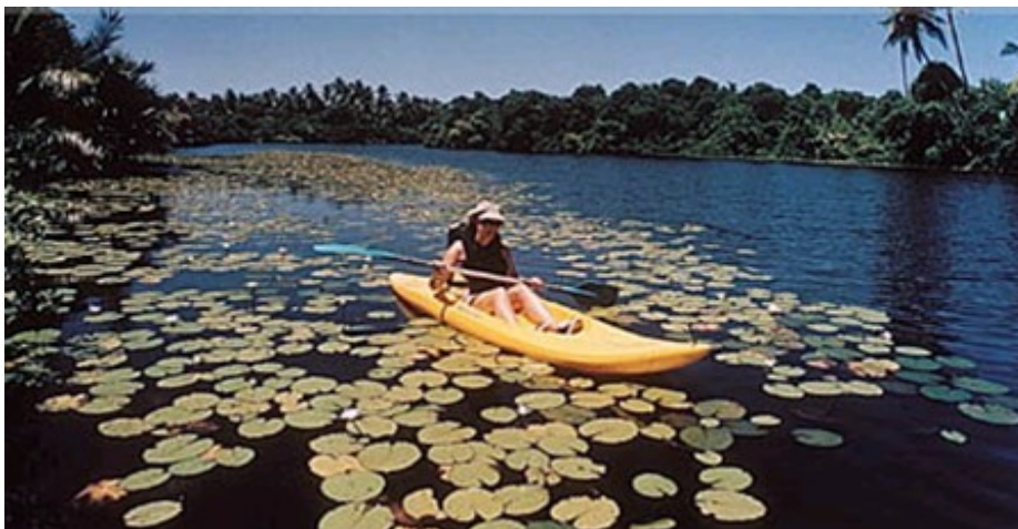
Dutch Canal At Negombo