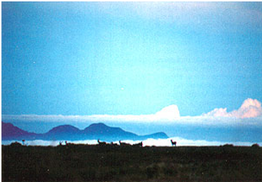
Sambar Deer At Horton Plains

The most amazing views in Sri Lanka are seen at Haputale , a small hamlet that sits on a ridge giving spectacular views of the southern plains stretching all the way to the Indian Ocean . On the way down from Haputale you pass the Diyalauma Falls , the 2 nd highest in Sri Lanka (694 ft)