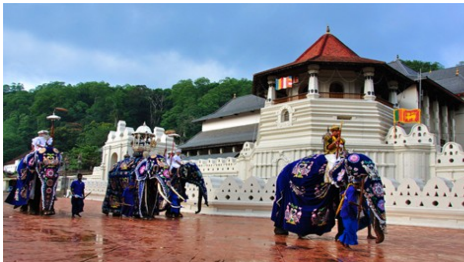
Temple Of The Tooth

The remarkable 'fortress in the sky'. A magnificent rock citadel with beautiful frescoes hidden in a natural cave dating from 470 A.D. The climb to the top from the huge stone Lions Paws is a dizzying experience with superb views over surrounding forests and distant hills. The newly excavated Royal Pleasure Gardens at the foot of the rock are some of the earliest from antiquity. Thought by many to be the 8 th Wonder Of The Ancient World!