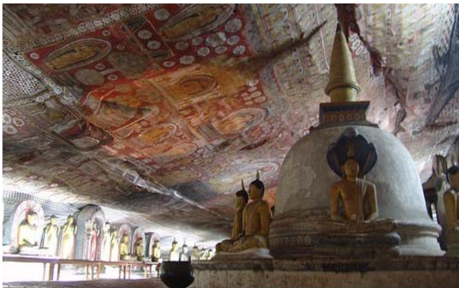
The Golden Cave Temple At Dambulla

Set in a pretty riverside location, this is home to about 70 Elephants - the largest group of orphaned Elephants in the world! Most have been found injured or abandoned in the wild. Baby calves, some only a few weeks old are fed by bottle and the whole herd is then bathed in the adjoining river. A tour highlight for many visitors to Sri Lanka .