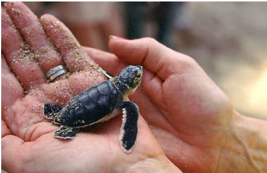
Baby Turtles At Kosgoda Hatchery

Here you may see baby turtles that are conserved for release into the ocean at an important turtle-nesting beach.