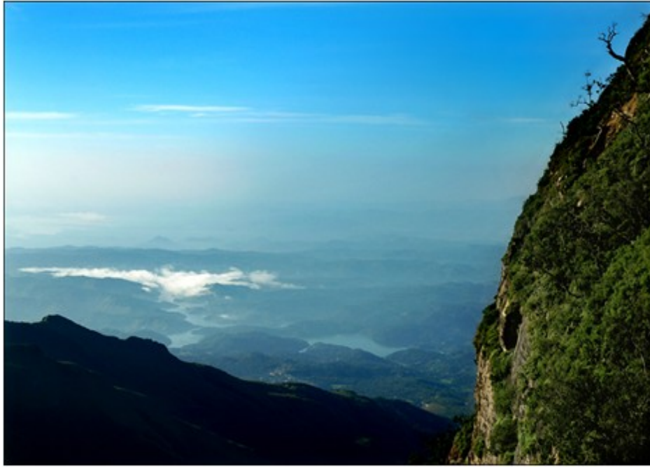
Awesome Views From World's End At Horton Plains