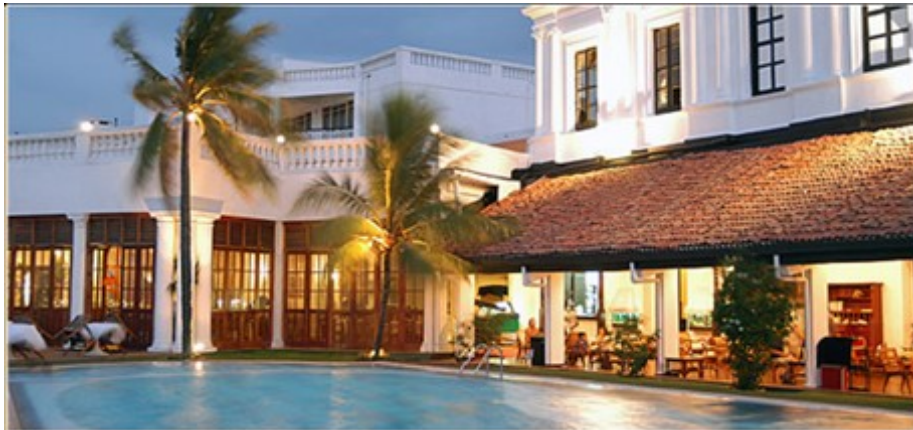
Mount Lavinia Hotel At Colombo

Colombo is an ideal location for rest and relaxation. Surrounding the city centre or Fort is the shopping area called Pettah with colourful bazaars and markets lining the streets. The best restaurants in the island are to be found in the city as well as a collection of world famous Old Empire hotels that hark back to a bygone era.