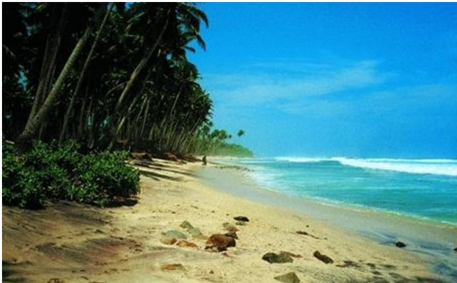
Sri Lanka's Fabulous Tropical Beaches