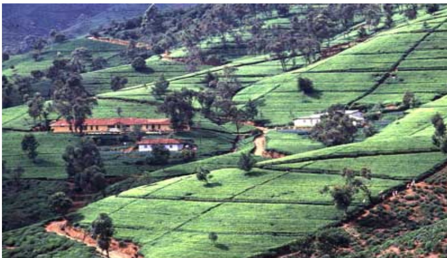
Tea Estates Near Nuwara Eliya