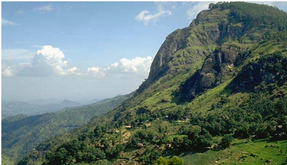
Hill Country Near Nuwara Eliya

Tea estates cover the mountains of the island in a vast expanse of green as far as the eye can see. Legendary Hill Stations of the British tea planters who came to Ceylon , as it was then known include Nuwara Eliya and Bandarawela . Amazing views from the southern escarpment of the Uva Hills can be experienced at Haputale and Ella .