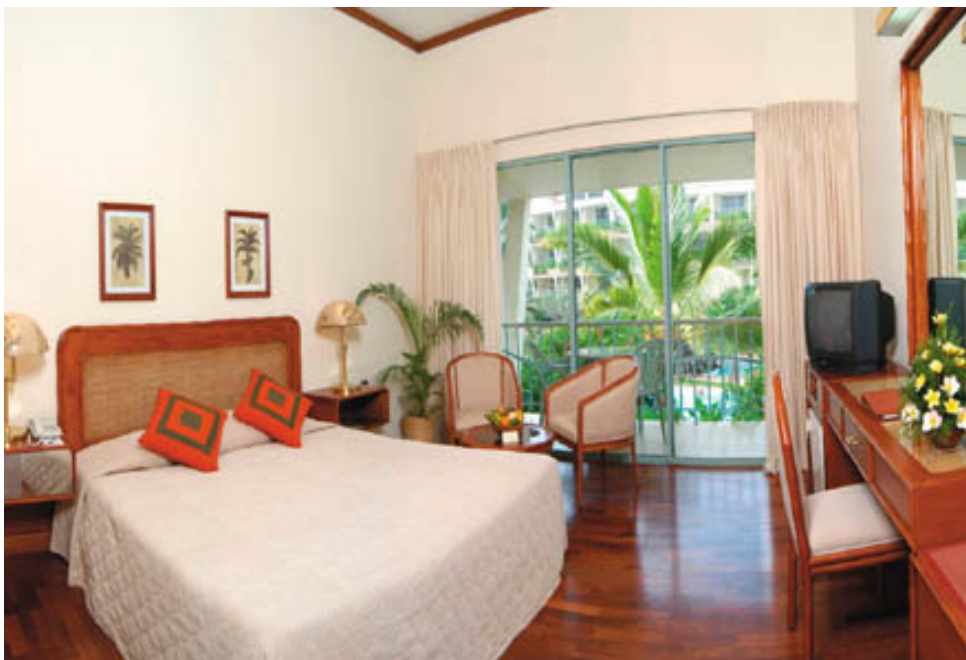
View Of Eden Standard Room

The Eden Resort And Spa is undoubtedly one of the finest 5 star beach hotels in Sri Lanka . The hotel occupies a prime site on the famous ' Golden Mile ' beach at Bentota , the island's premier resort location. The Eden Resort And Spa also incorporates the island's first purpose built health spa and well being centre and caters to a varied international clientele including a host of UK holidaymakers.