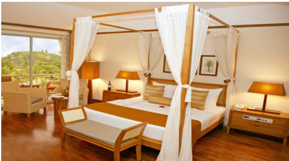
View Of Eden Paradise Deluxe Room