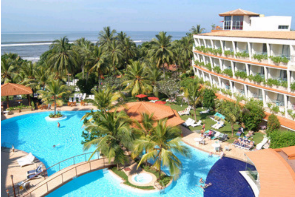
The Eden Resort And Spa Pool