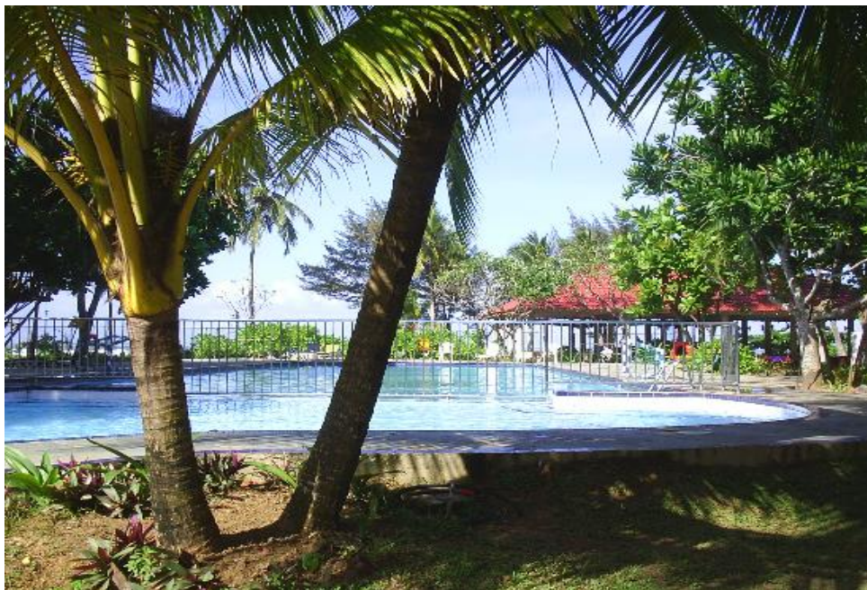
Pool At Club Palm Garden