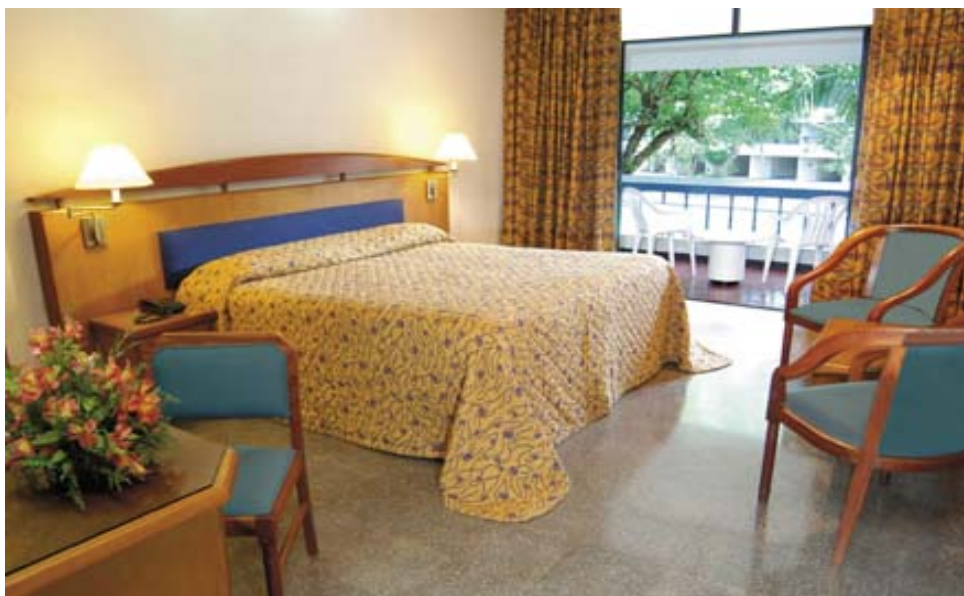
Club Palm Garden Bedroom

Set in spacious gardens leading down to Bentota beach, Club Palm Garden appeals especially to those who like to enjoy plenty of activities. The sea in front of the hotel is ideal for sea bathing and is one of the safest in Sri Lanka as it is protected by a near shore reef.