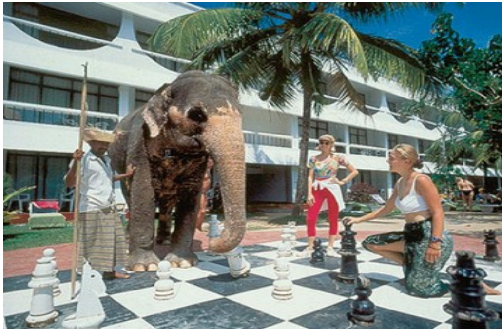
Elephant Chess At Club Palm Garden