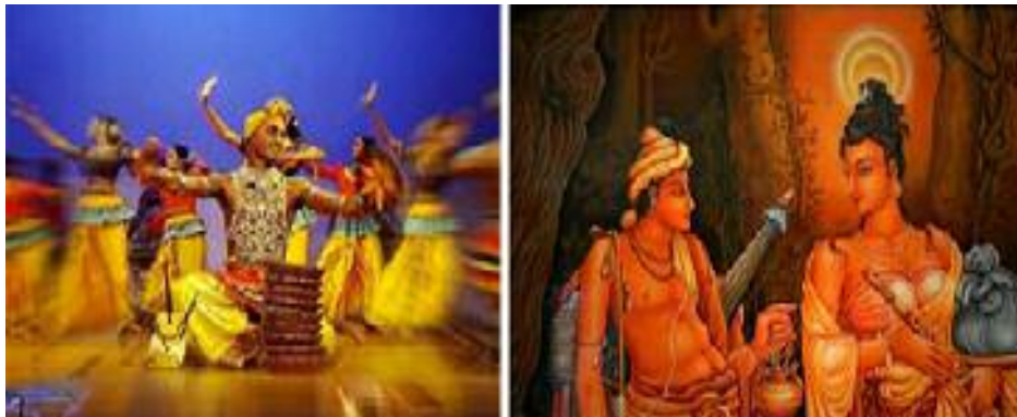
Kandy Temple Dancers And Paintings At Temple Of The Tooth

The remarkable 'fortress in the sky'. A magnificent rock citadel with beautiful frescoes hidden in a natural cave dating from 470 A.D. The climb to the top from the huge stone Lions Paws is a dizzying experience with superb views over surrounding forests and distant hills. The newly excavated Royal Pleasure Gardens at the foot of the rock are some of the earliest from antiquity. Thought by many to be the 8 th Wonder Of The Ancient World!