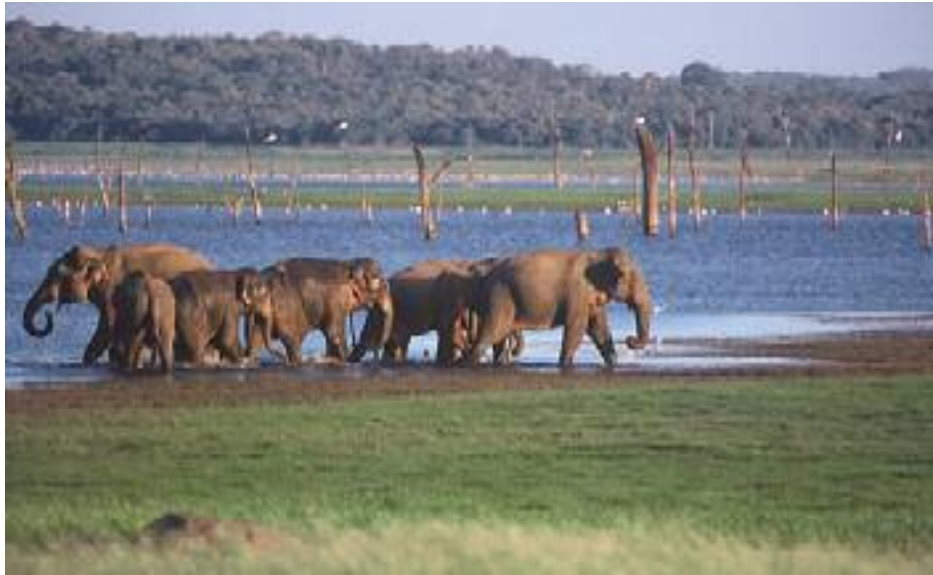
Elephants At Minneriya Lake