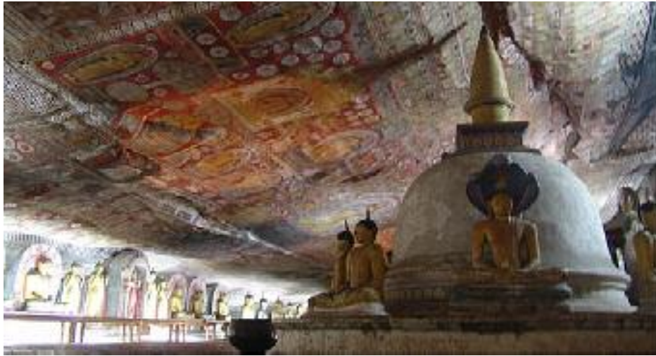
The Golden Cave Temple At Dambulla