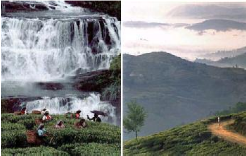
St Clair's Falls And Dramatic Hill Country Views