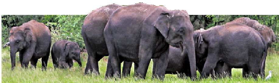
The 'Gathering' Of Elephants At Minneriya National Park