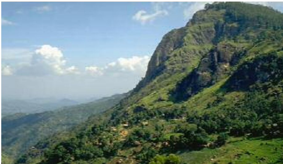
Hill Country Near Nuwara Eliya

The original Hill Station of the British tea planters who came to Ceylon , as it was then known. There is a Hill Club , Grand Hotel , the oldest Golf Course in Asia and even a Race Course - all are bygone reminders of an English social life that once thrived here.