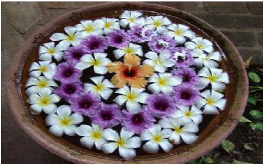
Flowers In Water At Waikkal

Waikkal and Marawila are idyllic fishing villages surrounded by a sea with crystal blue water, golden beaches with catamarans and billowing sails bringing home the catch of skipjack, herring, mullet, lobster, prawn and crabs caught in the lagoons.