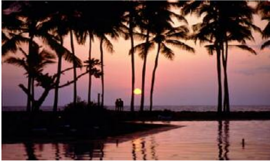
Sunset At Waikkal