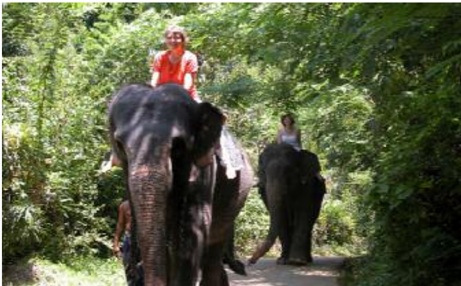
Elephant Ride At Millennium Elephant Foundation

Set in a pretty riverside location, this is home to about 70 Elephants - the largest group of orphaned Elephants in the world! Most have been found injured or abandoned in the wild. Baby calves, some only a few weeks old are fed by bottle and the whole herd is then bathed in the adjoining river. A tour highlight for many visitors to Sri Lanka .