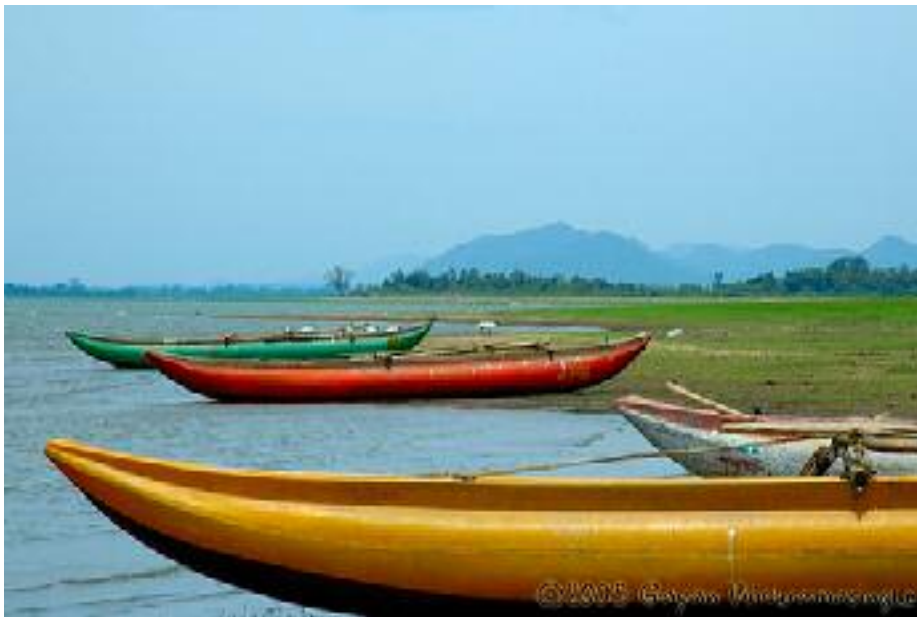
Beautiful Minneriya Lake

Take a jeep tour of Kaudulla or Minneriya Lake where wild elephants gather by the water's edge in the afternoon. During August and September at Minneriya you may encounter the biggest herds of Asian Elephants to be found anywhere in the world (up to 300!). Both National Parks are located around very beautiful lakes in exquisite natural surroundings.