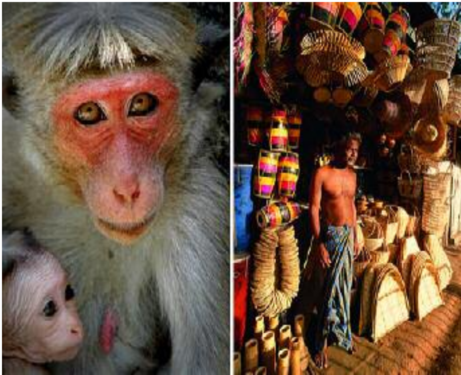
Monkeys And Basket Shop At Dambulla

An extremely ancient series of 5 cave temples containing thousands of Buddhist images and paintings, which date back 2000 years. Sri Lanka's artistic masterpiece and a UNESCO World Heritage Site of prime importance.