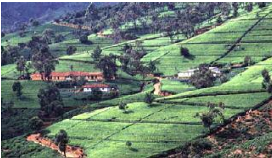
Tea Estates Near Nuwara Eliya