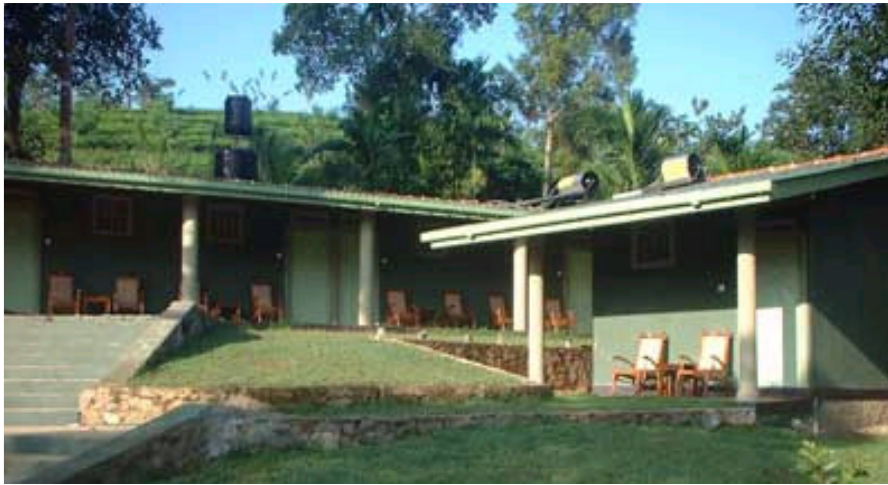
Blue Magpie Lodge