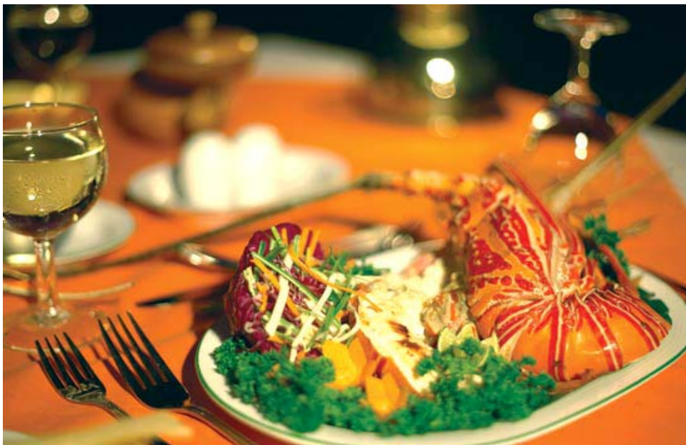
Delicious Cuisine At Amaya Lake

As an eco resort, Amaya Lake lets you experience nature throughout your stay. Around the grounds you will find labels on plants and trees identifying each species. An amazing variety of birdlife calls the resort home and hotel naturalists are happy to lead you on a bird watching expedition. Enjoy the opportunity to view graceful White Egrets , bright emerald Alexandrine Parakeets , Golden Orioles , colourful Orange-Breasted Green Pigeons , bright yellow Oriental White Eyes , the Tickles-Blue Flycatcher , the Scarlet-Coloured Flamebacks and dozens of other species that share Amaya with its guests.