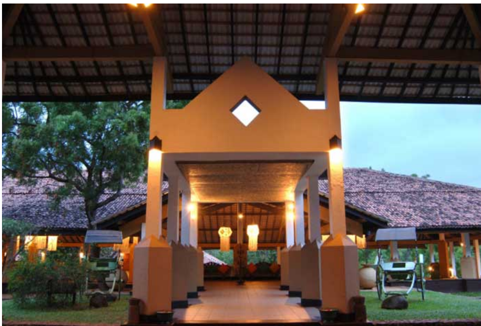
Entrance To Amaya Lake