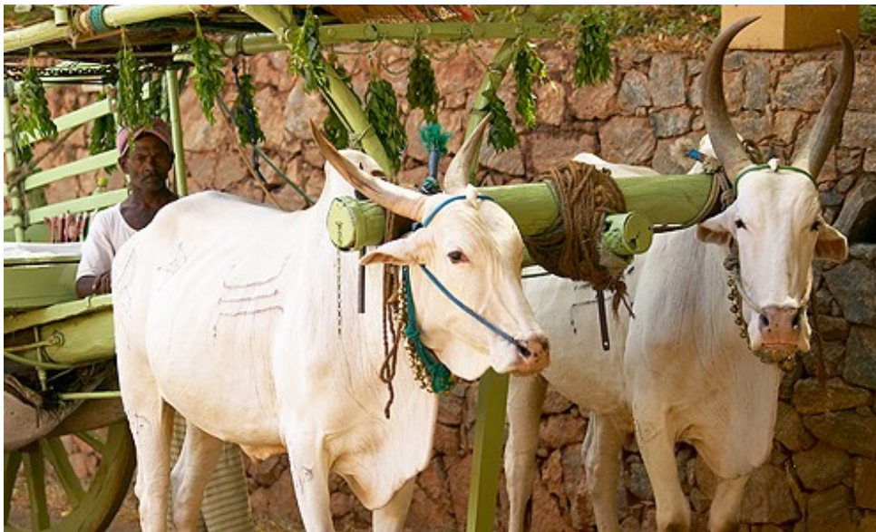
Bullock Cart Ride

The Amaya Lake is perfectly placed to explore the many historic delights of the Cultural Triangle . The Golden Cave Temples of Dambulla are about 15 minutes away. The magnificent rock citadel of Sigiriya can be reached in about 20 minutes. The ancient medieval royal capital of Polonnaruwa or the 2000 year old remains of Anuradhapura can be visited on day trips from Dambulla .