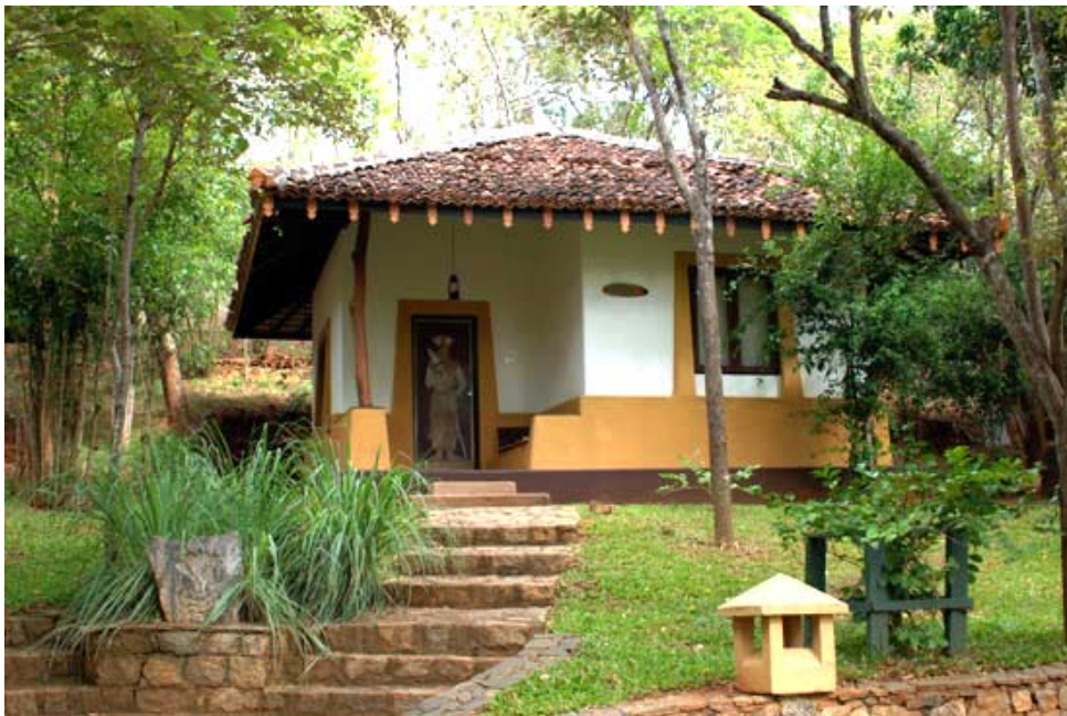
Exterior Of Chalet