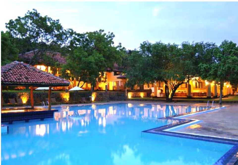
Pool At Amaya Lake

Kandalama Lake can be used for activities such as rowing, boating and fishing. Barbecues are also held in the evenings by the lake. Other excursions include bullock cart rides, jungle trekking and birdwatching.