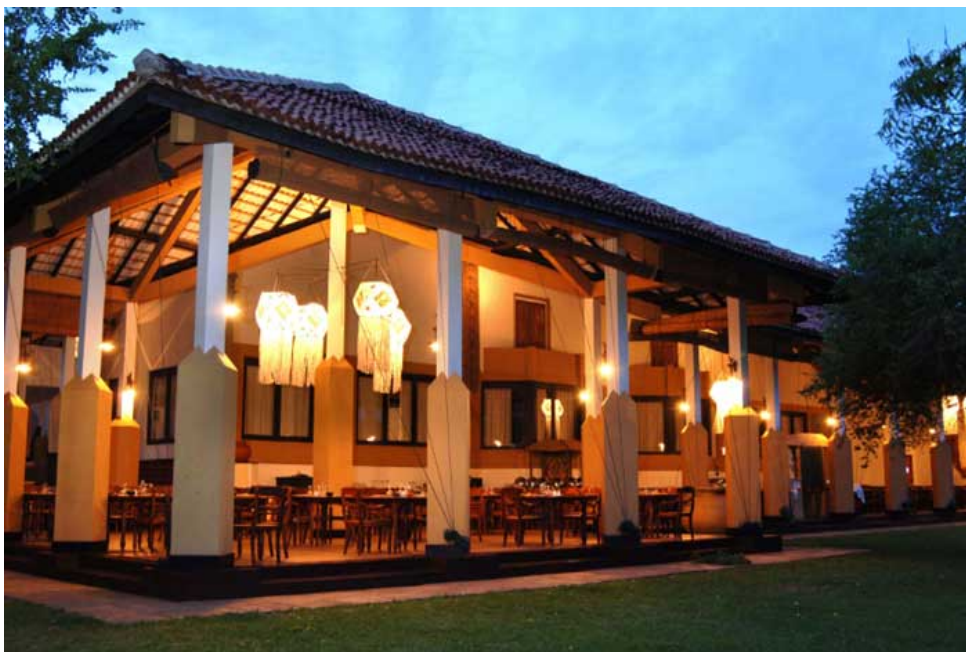
Open Air Restaurant At Amaya Lake

Four adjoining villas accommodate guests seeking a luxurious space of their own. Spacious high wooden ceilings and contemporary décor, with architecture inspired by the local area, and furnishings in elegant dark wood panelling. Plasma screen televisions add an element of modern luxury.