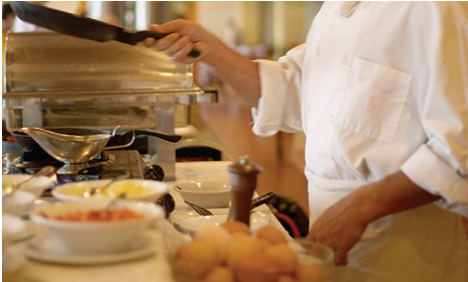
Amaya Hills Kitchen

Wi-fi access lets you surf the web throughout the resort.