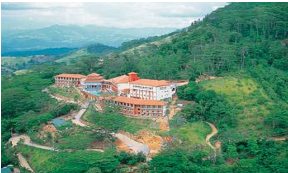
Spectacular Location Of Amaya Hills

The Billiards Hall delights fans of both pool and cricket. Autographs from numerous international cricket teams on cricket bats around the room. Other sports facilities include water polo, table tennis and squash courts. Le Garage is an underground nightclub in a high mountain setting. The most modern corner of a very traditional resort.