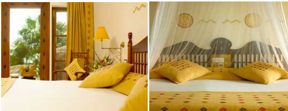
Bedroom At Amaya Hills

Each of the four Suites is named for previous governors of Kandy and features an antique noble costume encased in glass. Woodcarvings portray local religious imagery such as a dancing Shiva and celestial musicians. The suites are reached from the lobby or from the pool area via a stone staircase lined with natural boulders.