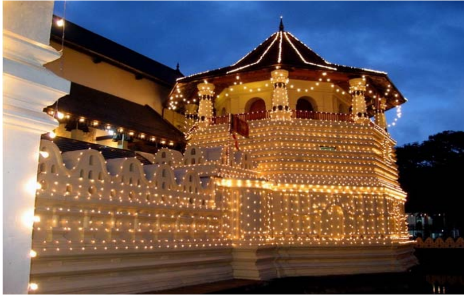
Temple Of The tooth At Night