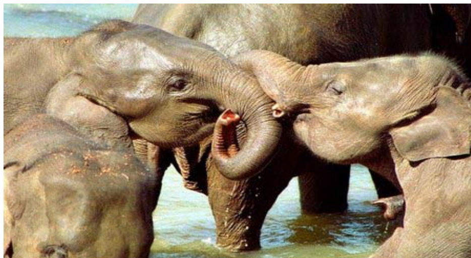
Pinnawela Elephant Orphanage