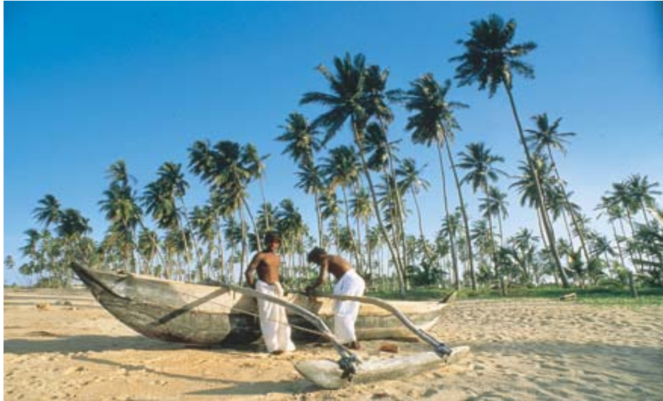
An Idyllic Beach In Sri Lanka