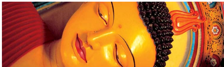
Reclining Buddha At Kandy