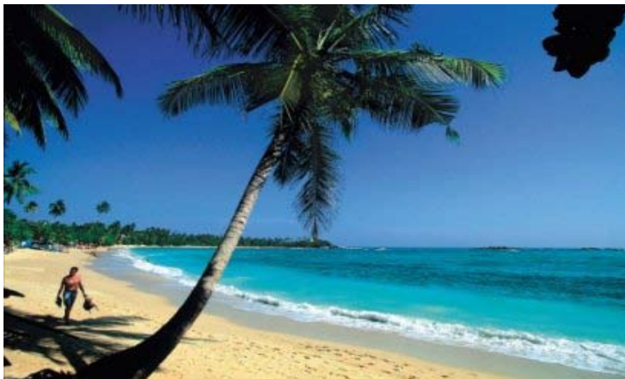
Beach On The South West Coast

Sri Lanka's popular South West beach resorts span the entire length of the coast to the south of Colombo , absorbing Wadduwa , Kalutara , Bentota and Kosgoda . This is the country's tropical belt with a lush hinterland composed of villages and market towns interspersed with coconut groves and rubber estates. The coastal areas have a series of lagoons and estuaries that can be easily explored by riverboat.