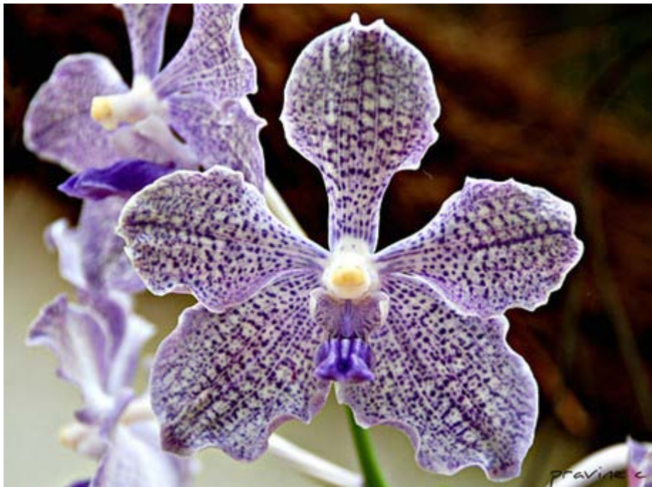
Amazing Orchid At Peradeniya's Orchid House

There are several 'plant world records' held by Peradeniya . The riverside Bamboo groves are in the Guinness Book Of Records as the fastest growing recorded plants in the world! There is also a huge Benjamina tree covering a surface area of 3000 square feet!