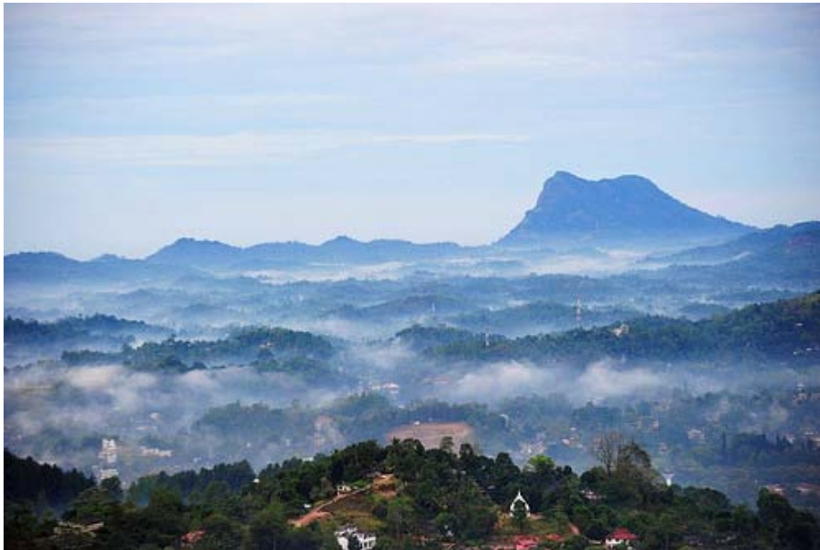
View Of Kandy In The Morning Mist

The journey by road through Colombo's suburbs takes you to the lush tropical lowlands interspersed with paddy fields and coconut plantations of the Western Province of the island. The famous and highly scenic ascent of the Kandyan Hills reaches its climax at Kadugannawa Pass .