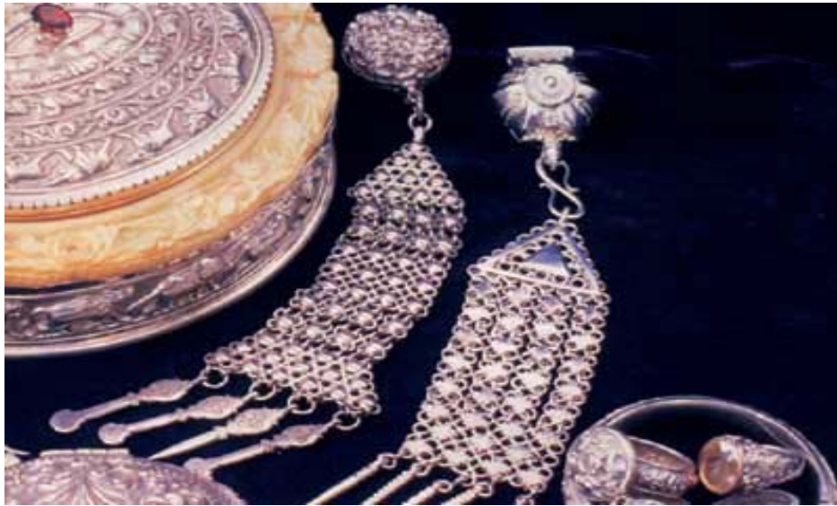
Kandy At Night