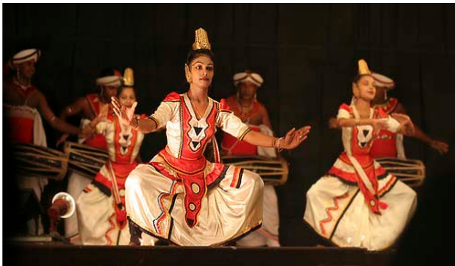
Kandyan Cultural Performance

Kandy also has a collection of famous British colonial era hotels, which have not changed much since the 1950's. The Queens Hotel actually dates from 1835 and The Hotel Suisse was Lord Mountbatten's World War 2 Asia Command Staff Headquarters .