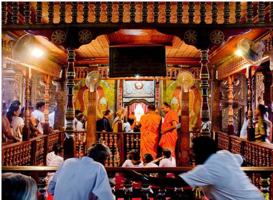
Inside The Temple Of The Buddha's Tooth

A beautiful view of Kandy can be seen from Lake Drive above the pretty Kandy Lake . You may also visit the Old Town area adjacent to the temple, which contains some very early British colonial and Kandyan period buildings in a narrow maze of streets. UNESCO has designated the whole area as a World Heritage Site .