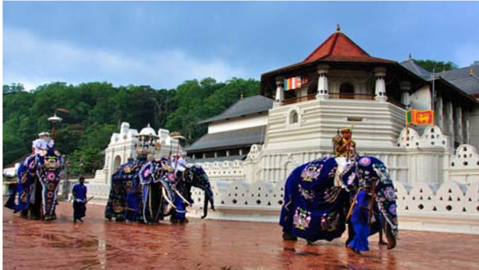
Temple Of The Tooth