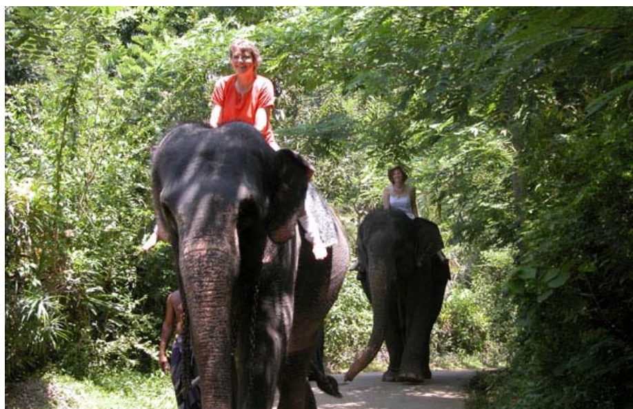
Elephant Ride At Millennium Elephant Foundation

Set in a pretty riverside location, this is home to about 70 Elephants - the largest group of orphaned Elephants in the world! Most have been found injured or abandoned in the wild. Baby calves, some only a few weeks old are fed by bottle and the whole herd is then bathed in the adjoining river. A tour highlight for many visitors to Sri Lanka .